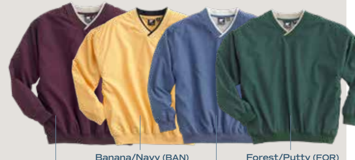
Banana/Navy (BAN) Forest/Putty (FOR) Burgundy/Putty (BUR) Atlantic Blue/Ivory (ATL)